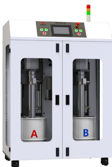
PRO-CPD20(20L Dual Can Pump)