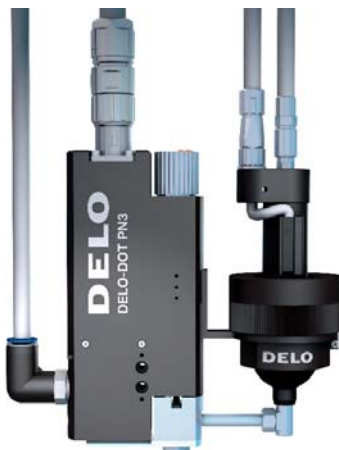
DELO-CONTROL PN3 with DELO-XPRESS pressure tank for DELO FLEXCAP